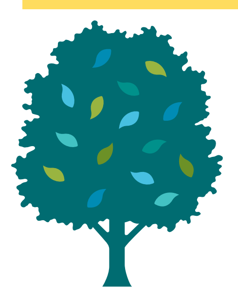
Growth in the midst of famine.

I firmly believe that it is not a time to draw back, but it is a time to go forward. So, with this in mind, we begin this consecration with great anticipation...because I believe that God is up to something good! Something good in our personal lives. Something good in our families. Something good in our churches. Something good in our Nation. Something good around the world.